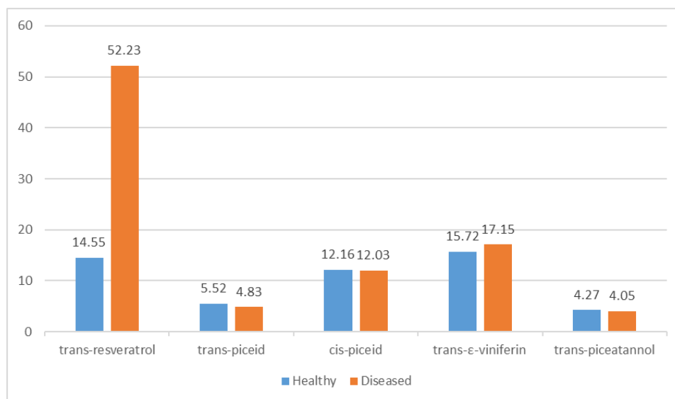
Fig. 2. Change of physiological concentration of stilbenoids of the grape Tsolikouri in condition Grey Mildew

concret: trans-resveratrol, trans-piceid, cis-piceid, trans- \epsilon -viniferin, trans-piceatannol et all. Among identified stilbenoids dominant was trans-resveratrol. From above mentioned stilbenoids quantitation change suffered and revealed following stress-metabolites in condition gray mildew of grape skin: trans-resveratrol, trans- \epsilon -viniferin, trans-piceid, trans-piceatannol. To the action of Botrytis Cinerea concentration of trans-resveratrol grow 14.55mg/kg \rightarrow 52.23mg/kg; trans-piceid 5.52 \rightarrow 4.83mg/kg; cis-piceid 12,16mg/kg \rightarrow 12,03mg/kg, trans-piceatannol 4.27mg/kg \rightarrow 4.05 mg/kg; difference is trans- \epsilon -viniferin, which concentration becomes increase 15,72 mg/kg \rightarrow 17.15mg/kg.